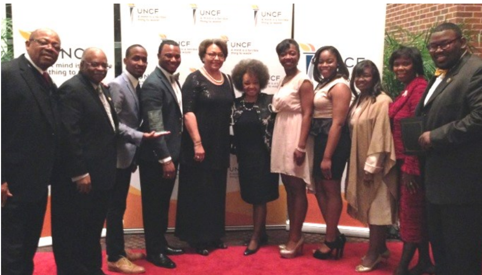
UNCF National Alumni Council / National Pre-Alumni Council 2014 Leadership Conference