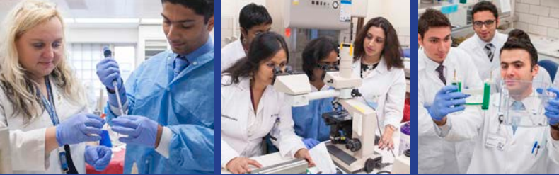
Bench Research Session