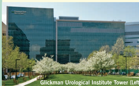
Glickman Urological Institute Tower (Left)

Cleveland Clinic is ranked as one of America's Top 4 Hospitals by U.S. News & World Report . Located in Cleveland, Ohio, Cleveland Clinic is a non-profit, multispecialty academic medical