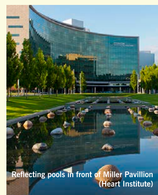
Reflecting pools in front of Miller Pavilion (Heart Institute)

To learn more, visit www.clevelandclinic.org