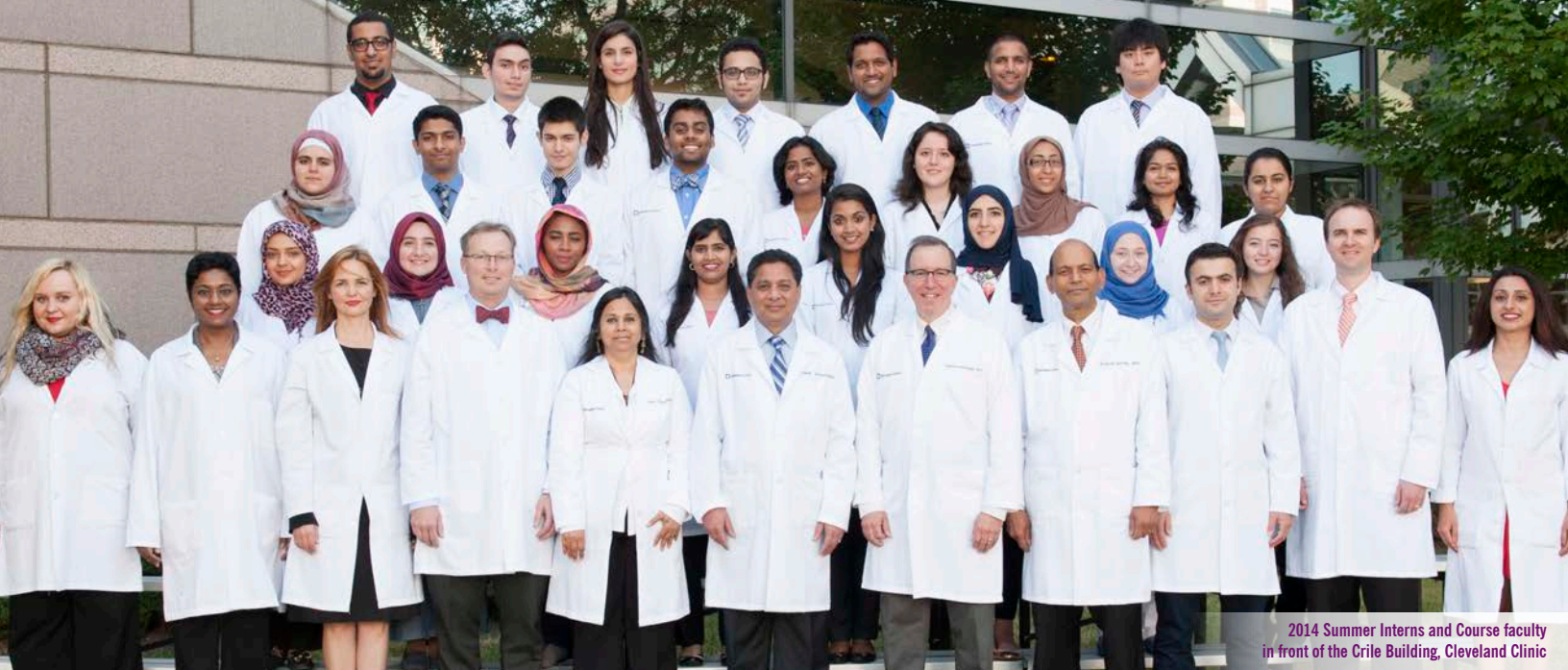
2014 Summer Interns and Course faculty in front of the Crile Building, Cleveland Clinic