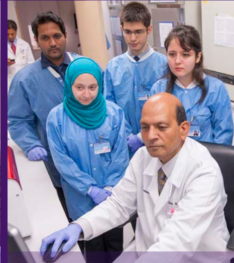
Bench Research Session