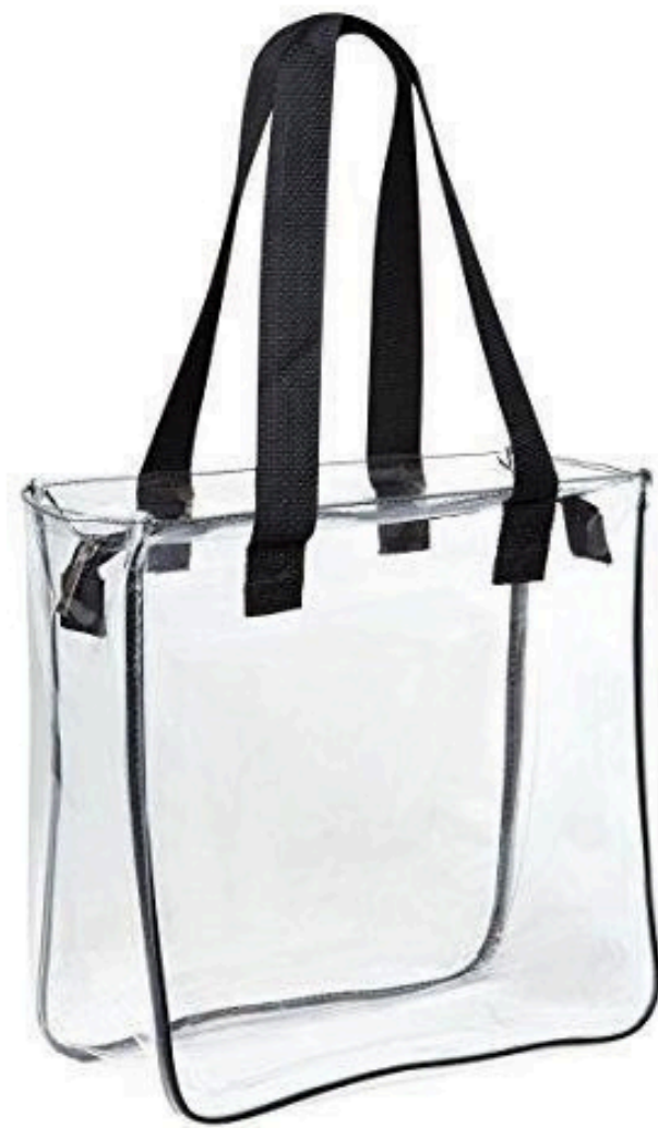
CLEAR PLASTIC BAG