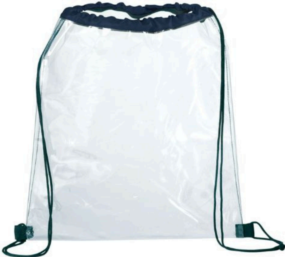
CLEAR DRAWCORD BACKSACK