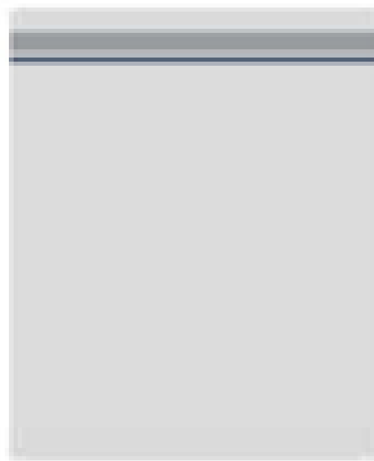
1 GALLON CLEAR PLASTIC FREEZER BAG