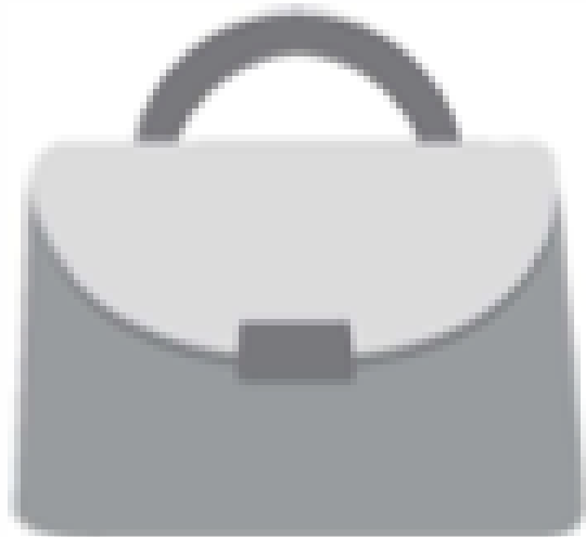
SMALL PURSE NO LARGER THAN 4.5" X 6.5"