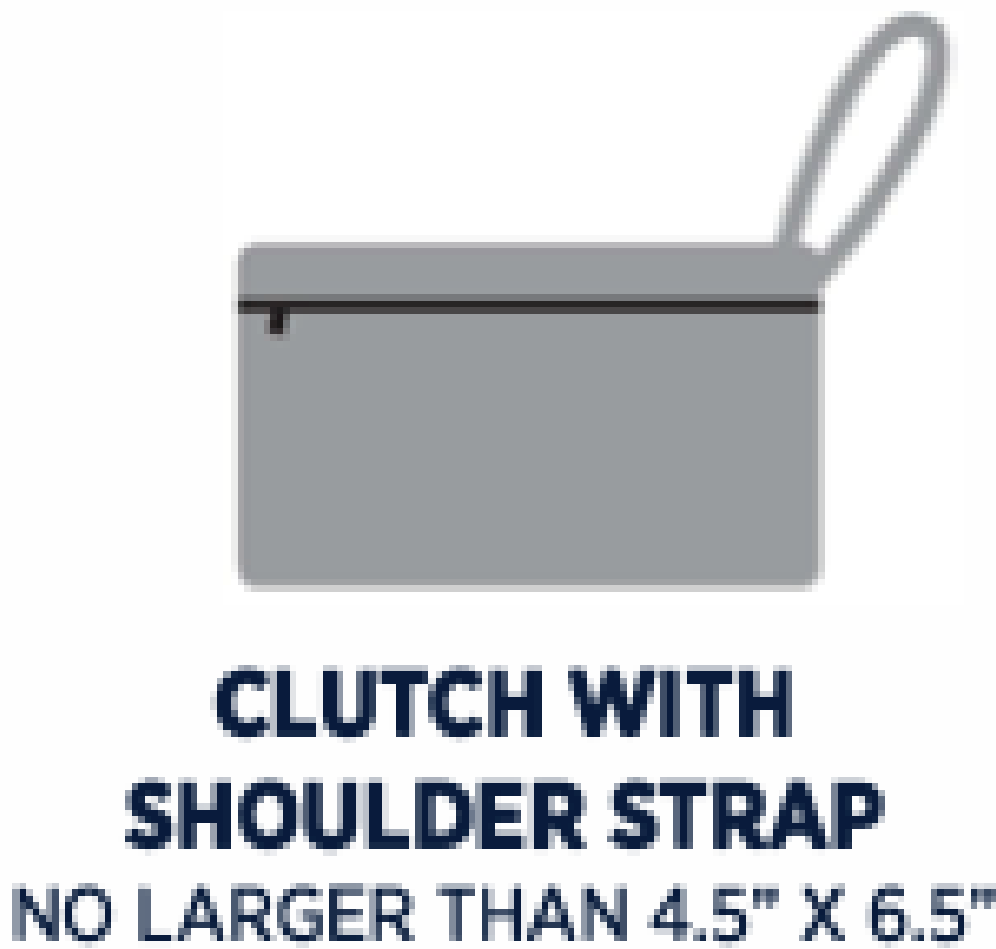
CLUTCH WITH SHOULDER STRAP NO LARGER THAN 4.5" X 6.5"