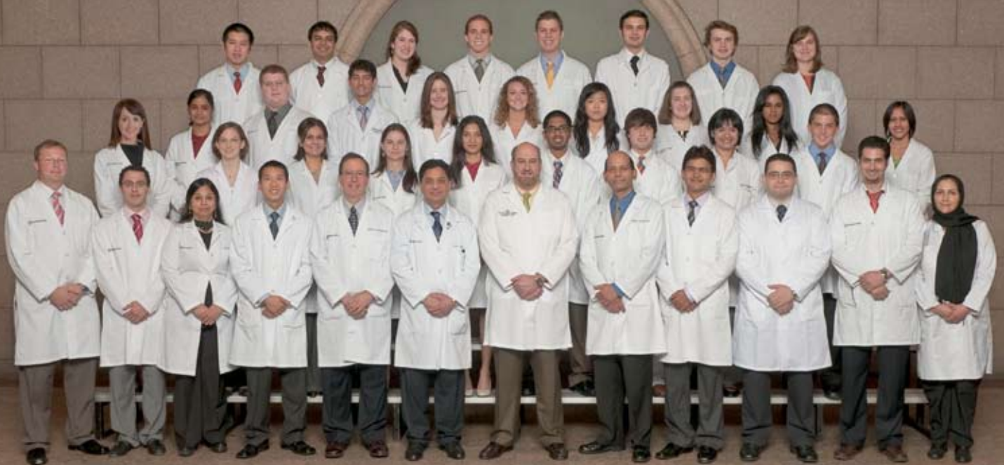
The Center for Reproductive Medicine Summer Internship class of 2010 (pictured here with the program faculty) was one of the largest in the program's history. Summer Interns come from leading colleges and universities, including Princeton, Notre Dame and The University of Pennsylvania, to enjoy the research and academic experience.